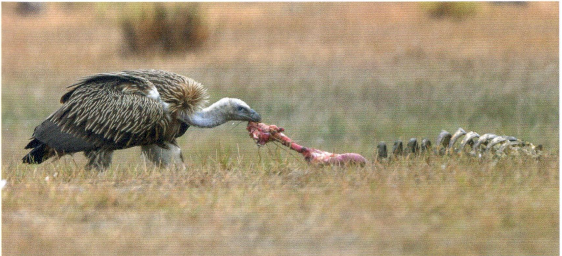
Plate 3. A juvenile Himalayan Griffon at the feeding station, Pakpli, Nakhon Nayok province, Thailand, 23 February 2019.

was organised, the operation being supported by KURU, through public donations. Fresh cattle carcasses and pigs' legs were provided every three days. Visceral organs, especially liver and kidney, were avoided to minimise the risk of poisoning from diclofenac residues. Five Himalayan Griffon—four juvenile and one fifth-calendar-year sub-adult (third plumage) (Forsman 2016)—were observed feeding here between 3 January and 13 February 2019. During their stay at the site, the vultures regularly roosted overnight in the same Hopea ferrea tree and visited the restaurant every two or three days. A camera-trap was used to confirm the presence and to count the number of vultures at the restaurant (video capture at http://www.birdsofthailand.org/content/feeding-stations-vultures ).