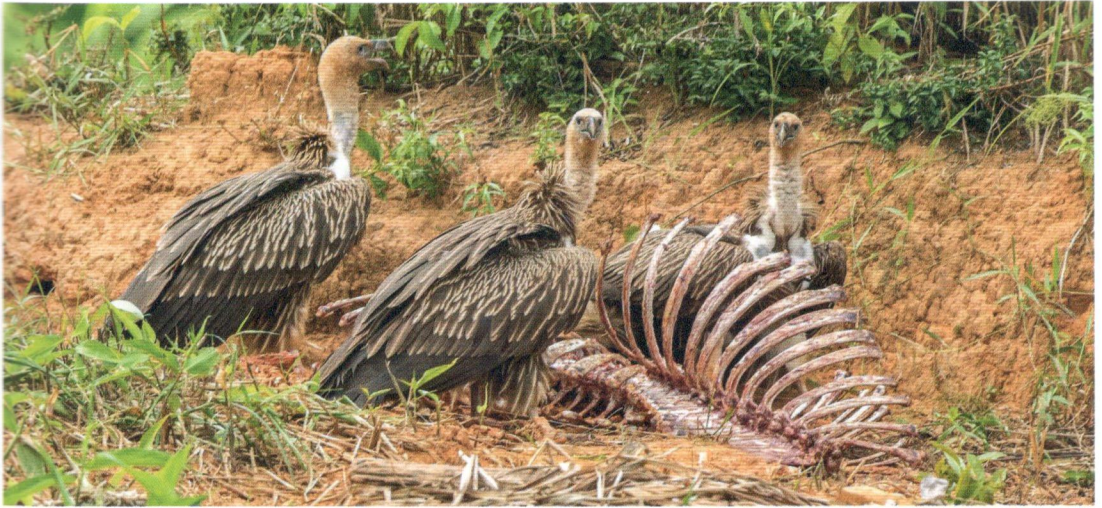
Plate 2. Three Himalayan Griffon at the feeding station, Chalong, 17 January 2019.