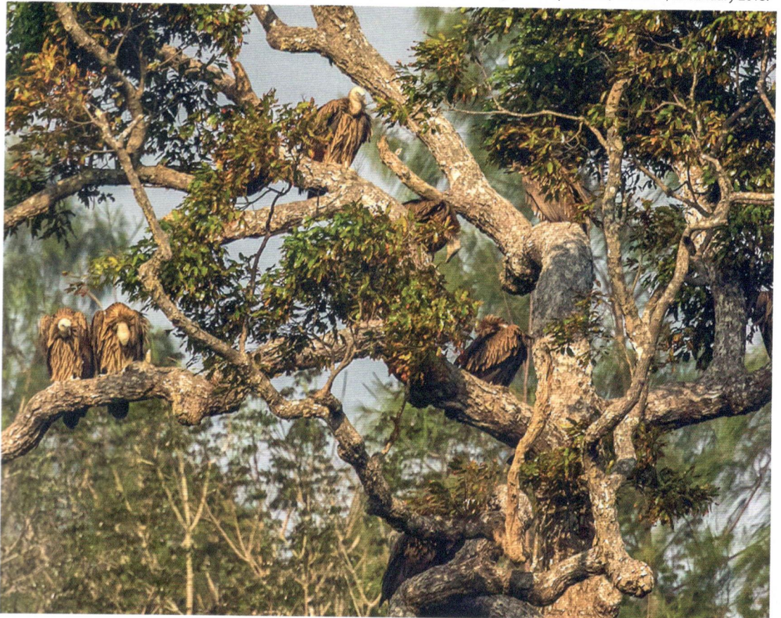
Plate 1. Himalayan Griffon Gyps himalayensis roosting on a Hopea ferrea tree, Chalong, Phuket province, Thailand, 28 January 2018.